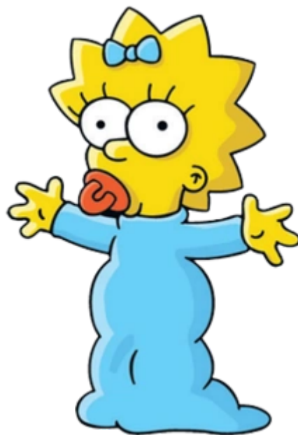
Margaret Evelyn Lenny Simpson

At the beginning Maggie seemed to rely on Marge and the likewise but eventually became fiercely independent as she was able to plan a Great Escape -style breakout from a daycare center to get all the babies' pacifiers back, which were being held under lock and key. Although treated by almost everyone as a helpless baby, she, in fact, sometimes exhibits violent mannerisms and a surprising amount of physical strength. She was able to lift up a mallet and bludgeon her father with it after being influenced by Itchy and Scratchy , as well as able to drag her father back to the shore when he got caught in a riptide. She is also surprisingly proficient with firearms and is a natural markswoman, shown when she